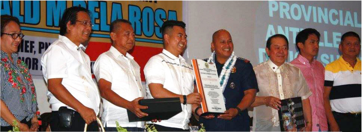
Awarding of the Plaque of Appreciation to PDG Ronald "Bato" Dela Rosa by the Provincial Officials of Ilocos Sur