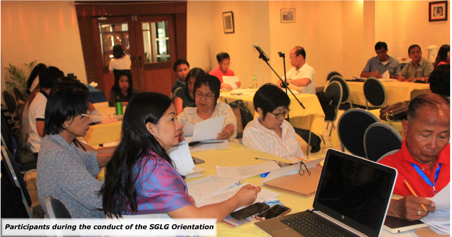
Participants during the conduct of the SGLG Orientation

The Department of the Interior and Local Government Region 1 (DILG RI) jump-started the implementation of the Seal of Good Local Governance (SGLG) 2017 with a regional orientation on May 5, 2017 at the Oasis Country Resort Hotel and Restaurant, City of San Fernando, La Union.