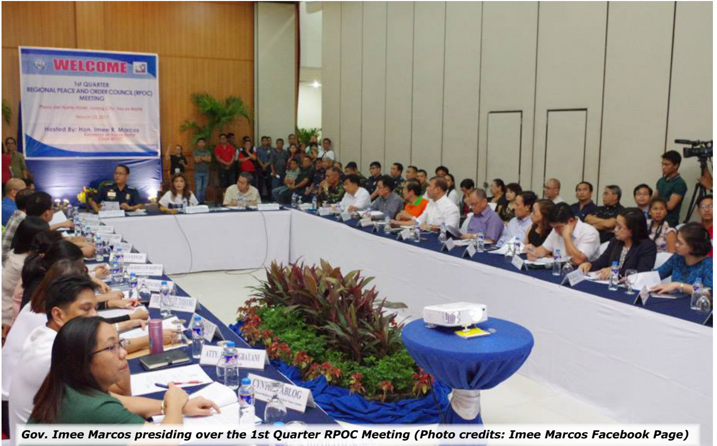
Gov. Imee Marcos presiding over the 1st Quarter RPOC Meeting

The 1st Quarter Regional Peace and Order Council (RPOC) meeting presided by Governor Imee R. Marcos, the newly appointed RPOC Chair, was held on March 22, 2017 at Plaza del Norte Convention Center, Laoag City, Ilocos Norte.