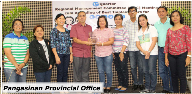
Pangasinan Provincial Office