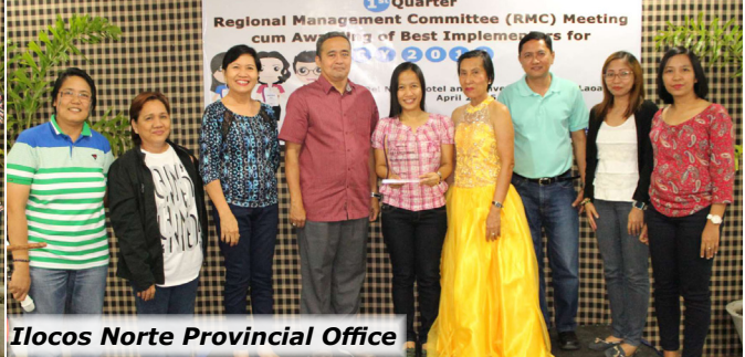
Ilocos Norte Provincial Office

The Department of the Interior and Local Government (DILG R1) awarded DILG La Union and DILG Pangasinan as the Most Compliant Provincial Office on Program, Project, and Activities (PPA) Implementation and Finance and Administrative Requirements and Most Outstanding Provincial Office on Locally-Funded Projects (LFPs) Implementation, respectively, during its 1st Quarter Regional Management Committee (RMC) Meeting cum Awarding of Best Implementers for CY 2016 on April 23-25, 2017 at Plaza del Norte Hotel and Convention Center, Laoag City.