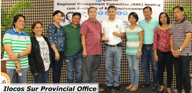
Ilocos Sur Provincial Office