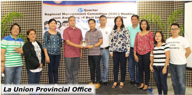
La Union Provincial Office