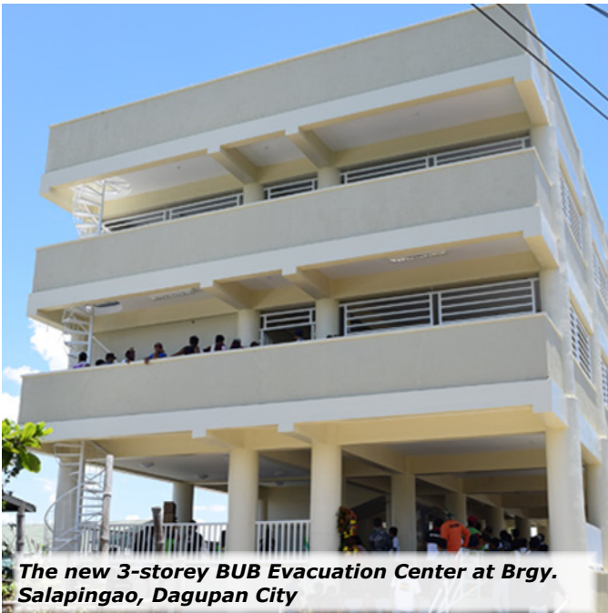
The new 3-storey BUB Evacuation Center at Brgy. Salapingao, Dagupan City