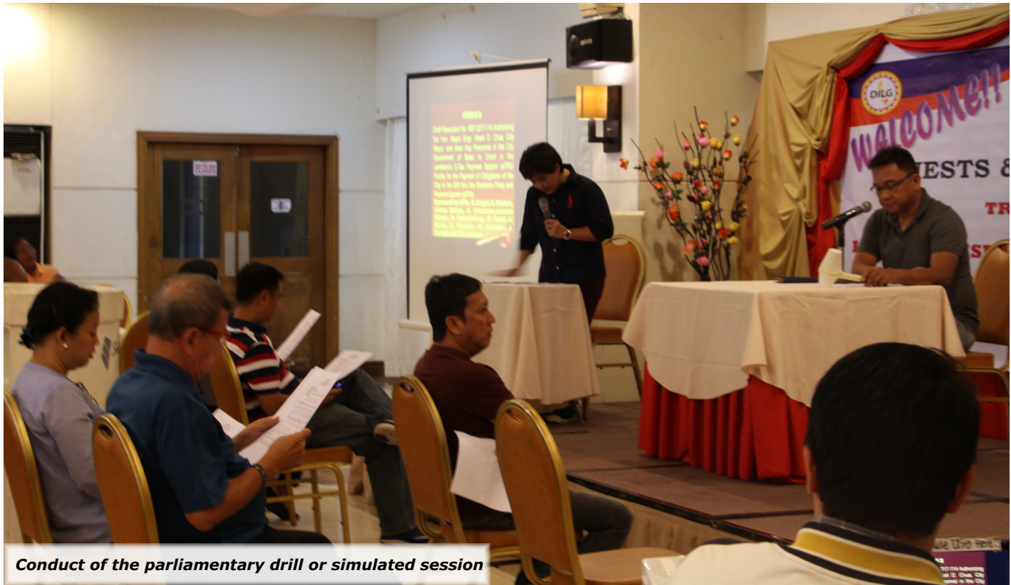
Conduct of the parliamentary drill or simulated session

The Department of the Interior and Local Government Region 1 (DILG R1) in partnership with the Vice Mayors League of the Philippines – Ilocos Norte Chapter jointly conducted a capacity development initiative entitled Local Legislation 101 Plus, Plus on June 7-9, 2017 at the Subic International Hotel, Freeport Zone, Subic, Zambales.