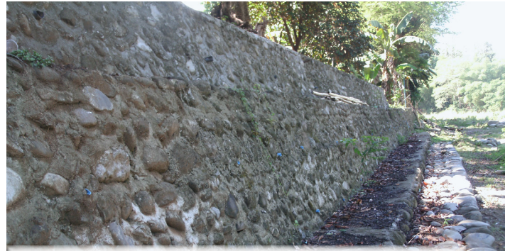
Flood Control System at Barangay Caoayan, Burgos, La Union constructed through the DILG's BUB 2014

Barangay Caoayan was among the four barangays chosen to be beneficiaries of the DILG's Bottom Up Budgeting (BuB) in 2014. With the objectives to reduce if not eliminate the disaster risk caused by flashfloods, and to provide continuity of agricultural and aquatic activities, the council decided to use the BuB fund to strengthen and stabilize entire slope along the river. According to the Punong Barangay (PB) , flood control project has always been on the top of her priority list.